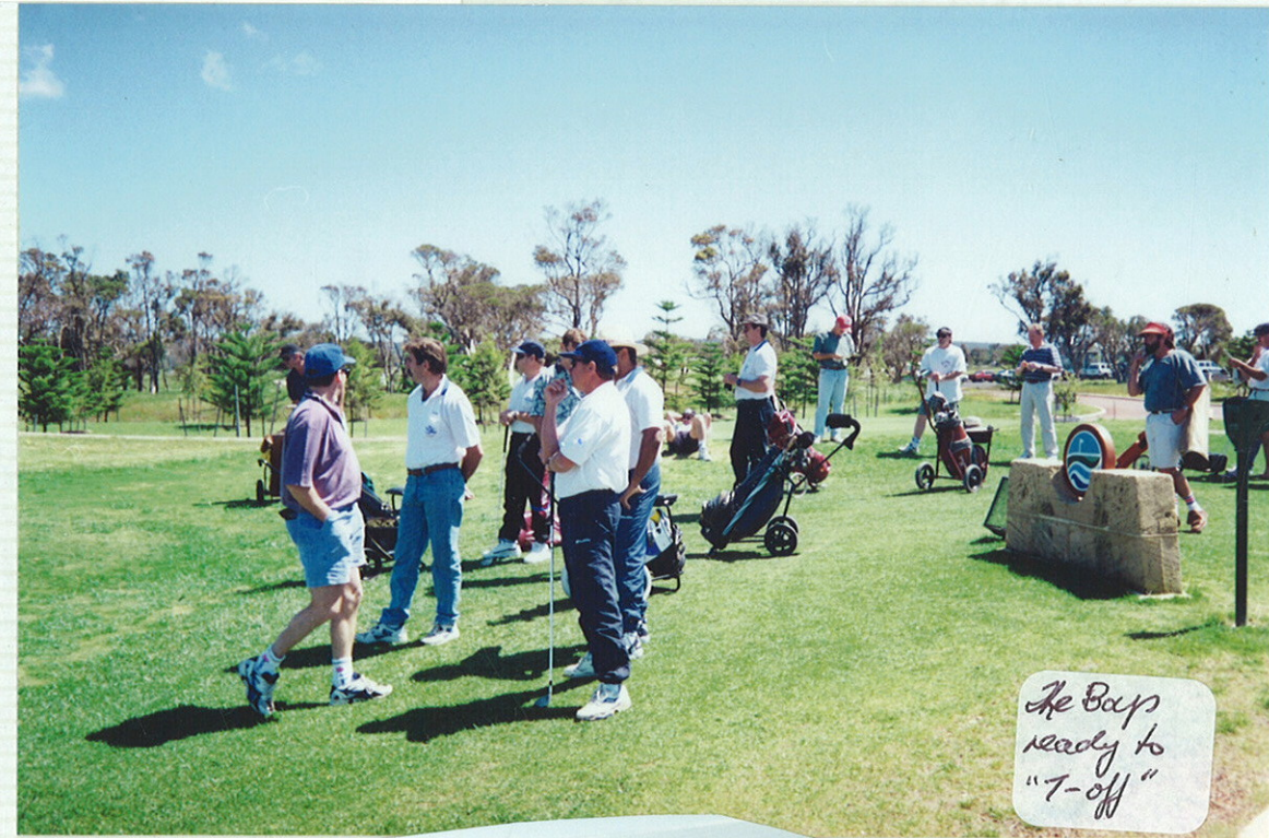
The Boys ready to "T-off"