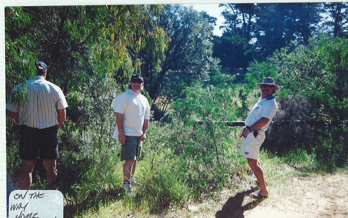
ON THE WAY HOME