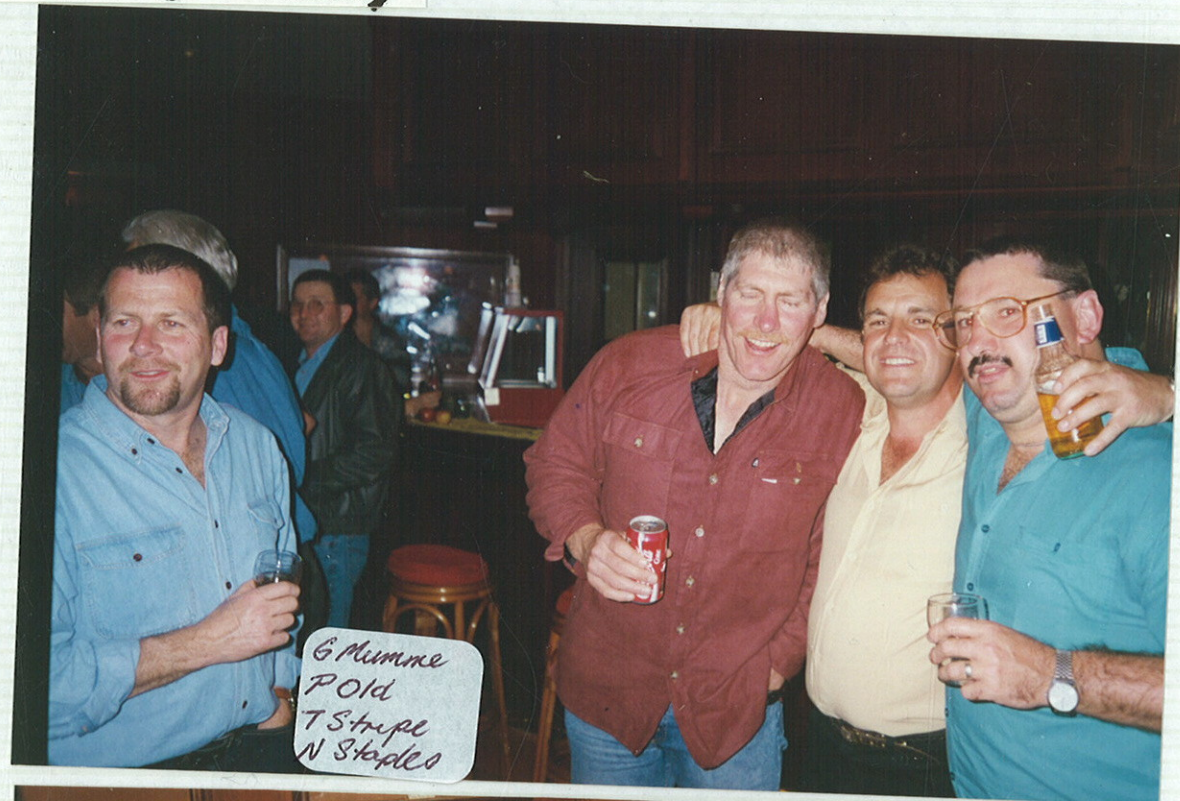
G Mumme P Old T Stripl N Stripl