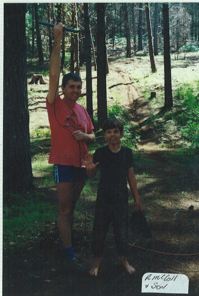
R McCall & Son