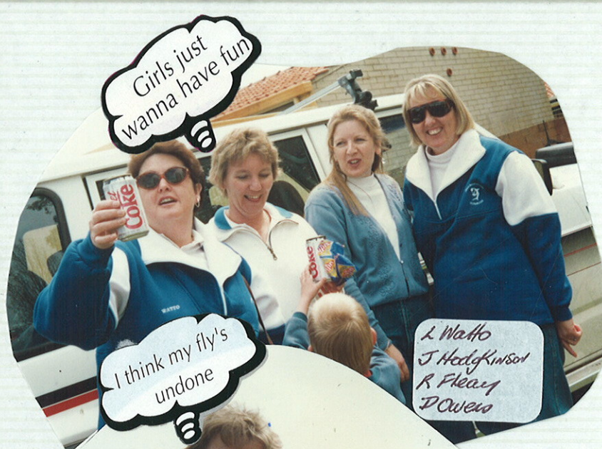
Girls just wanna have fun