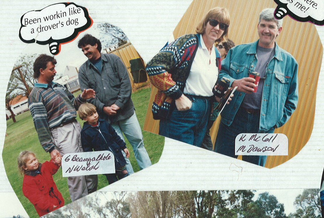
Been workin like a drover's dog