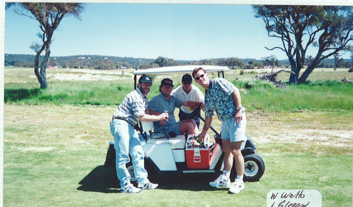
W Wall I Green