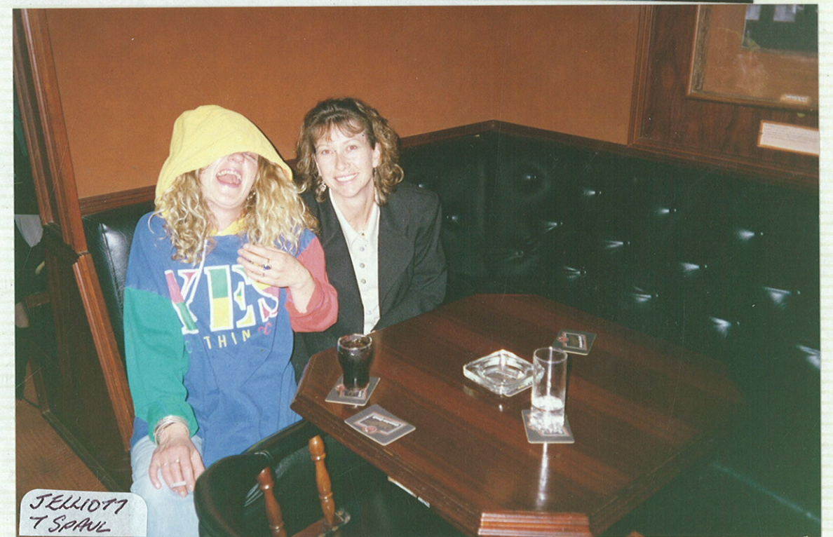
JELLIOTT T SPANL