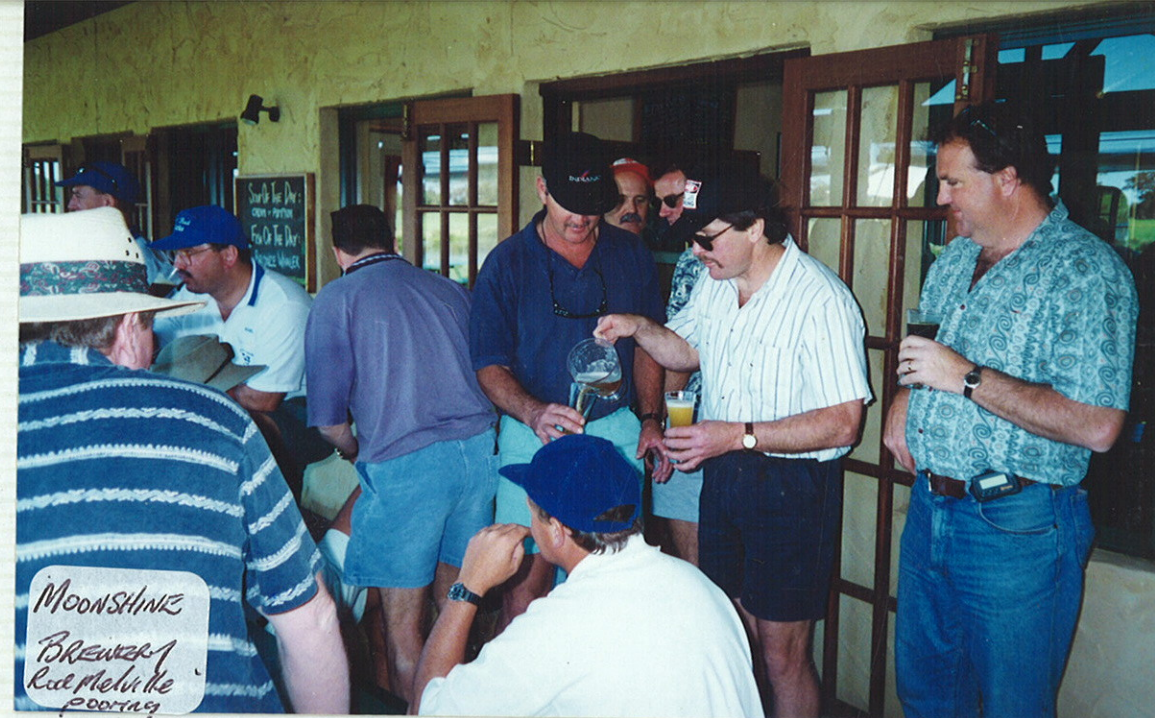
MOONSHINE BREWERY Red Melville pooling