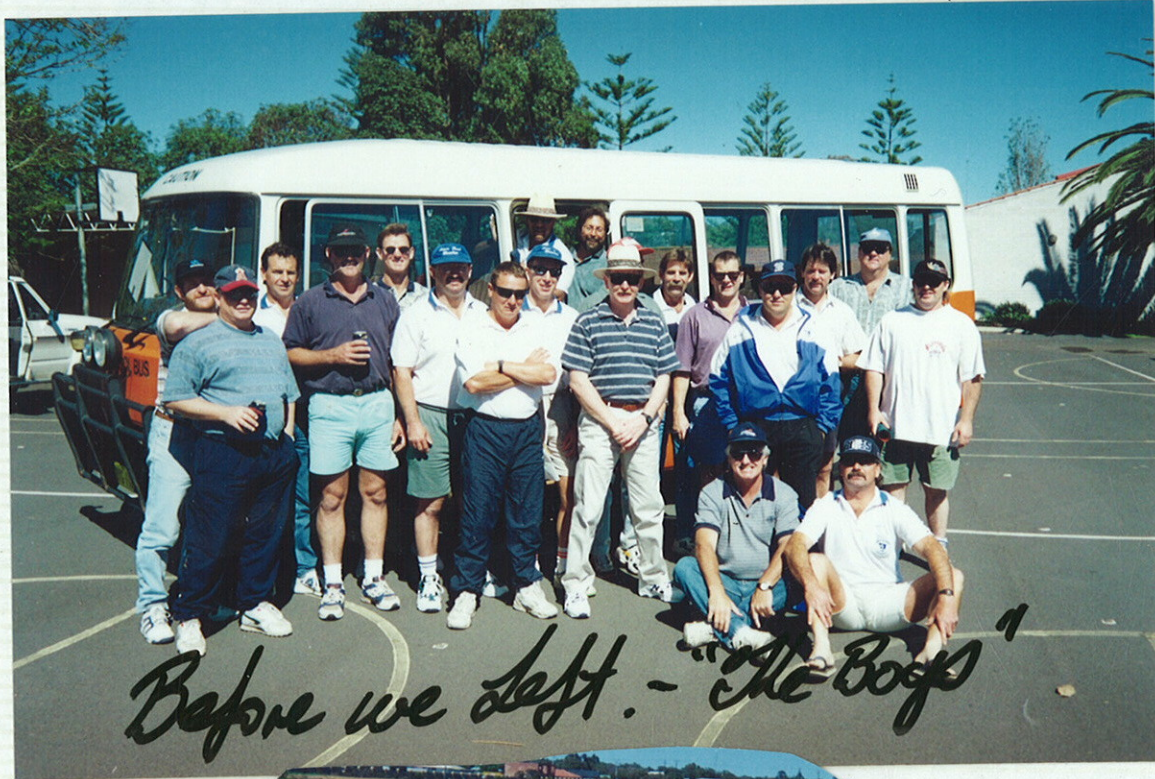
Before we left - "The Boys"