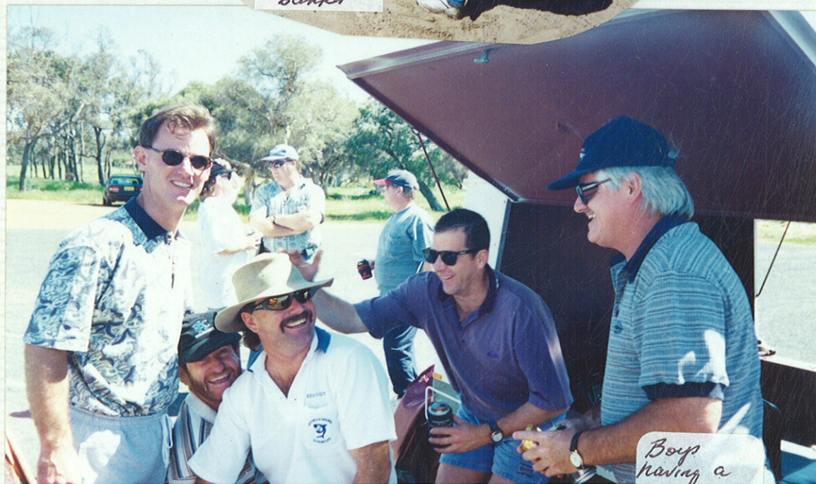
Boys having a